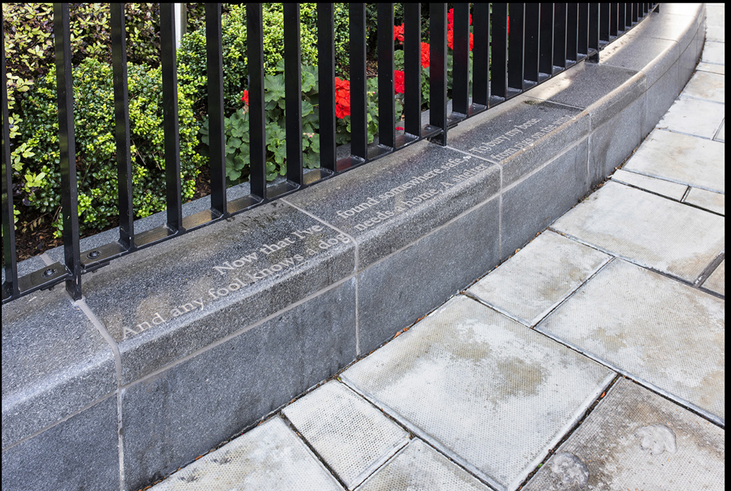
A Dog Needs a Home (2018) Stainless steel letters set in granite planks and dog paw prints in concrete slab, Vista development, Nine Elms, Battersea, London