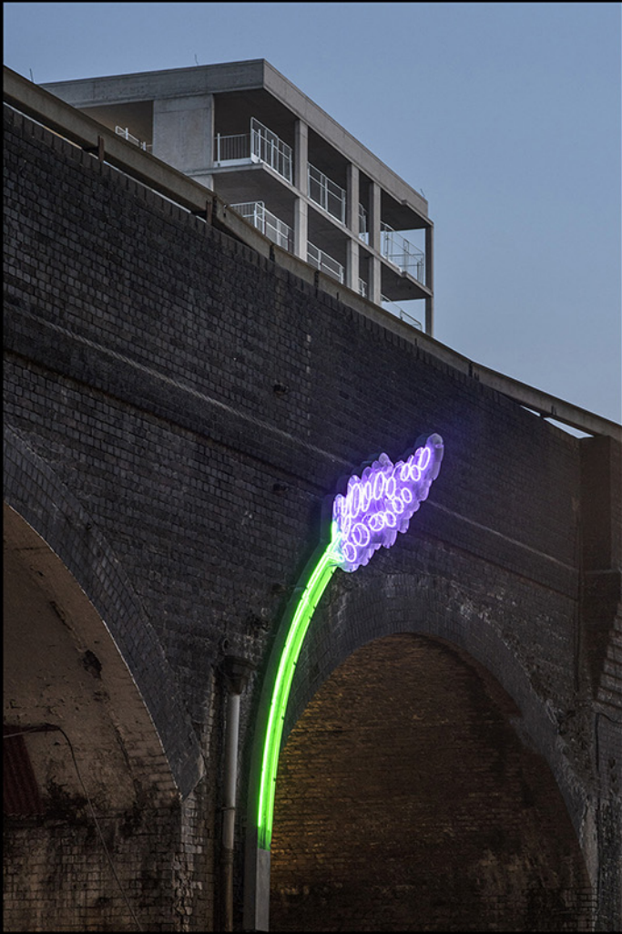
Lavender (2018) Neon and powder-coated metal case, Vista development, Nine Elms, Battersea, London