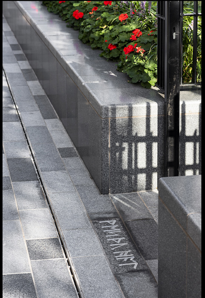
Wassail (2018) Stainless steel letters set in granite plank, Vista development, Nine Elms, Battersea, London