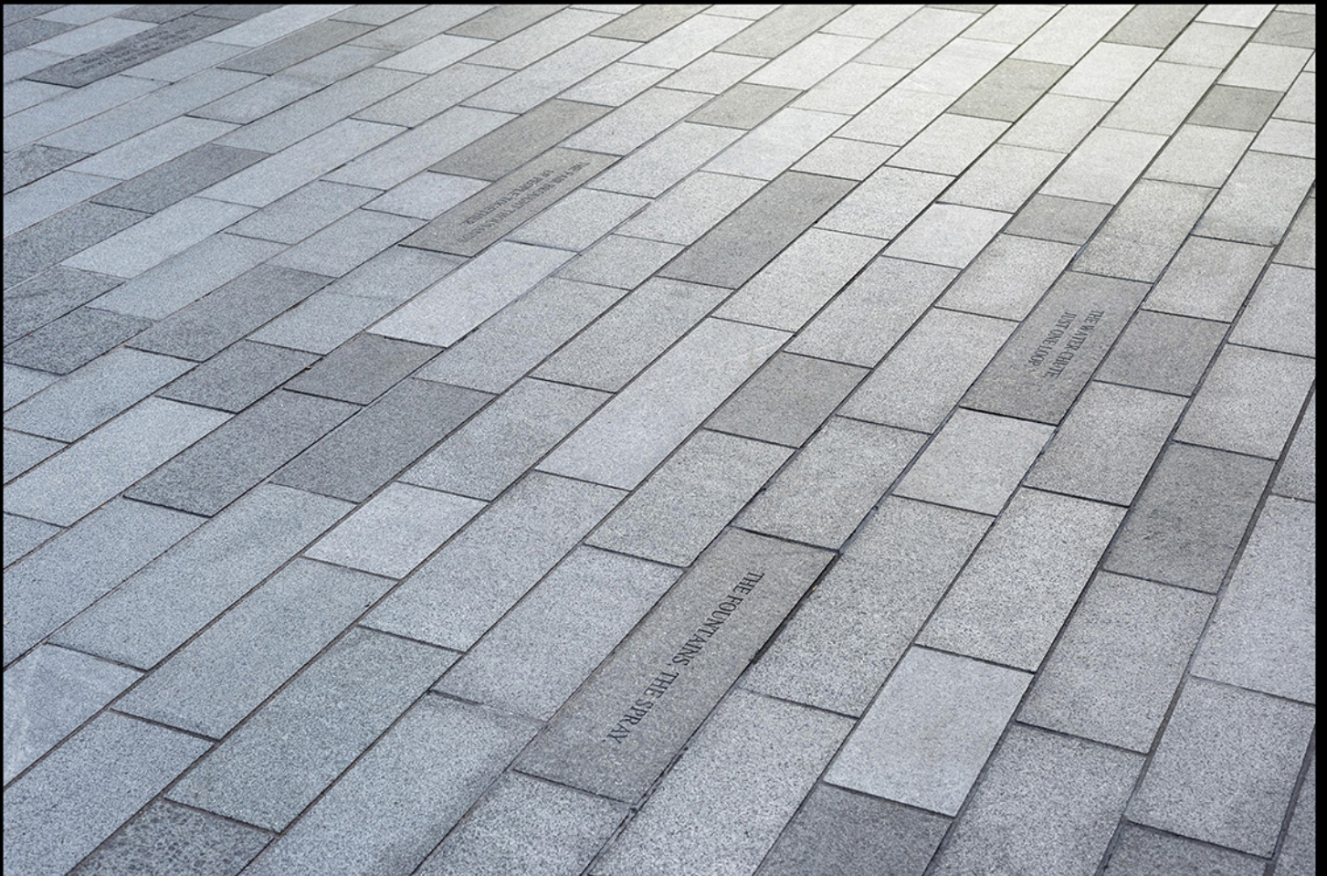
Pleasure Gardens (2018) Engraved text in granite plank, Vista development, Nine Elms, Battersea, London