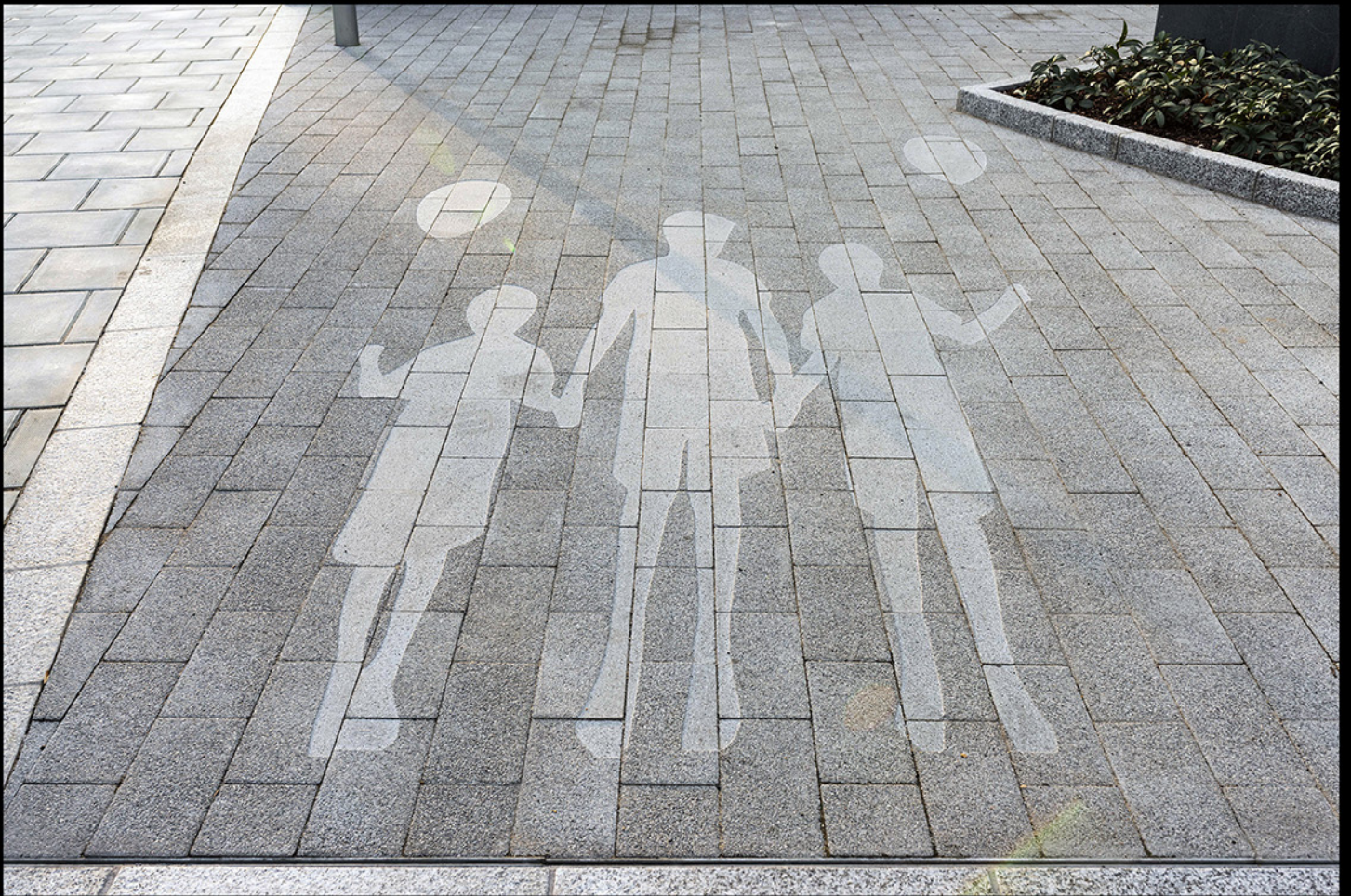
Balloons for Sale (2018) Engraved granite blocks, Vista development, Nine Elms, Battersea, London