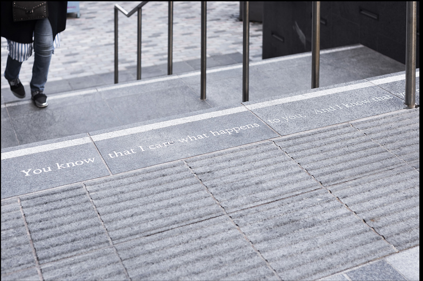
Weight of the Stone (2018) Stainless steel letters set in granite planks, Vista development, Nine Elms, Battersea, London