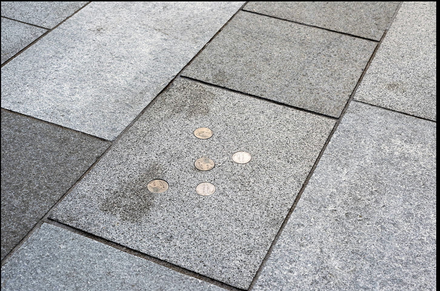
2s 6d (2018) 1903 coins set in granite slab, Vista development, Nine Elms, Battersea, London