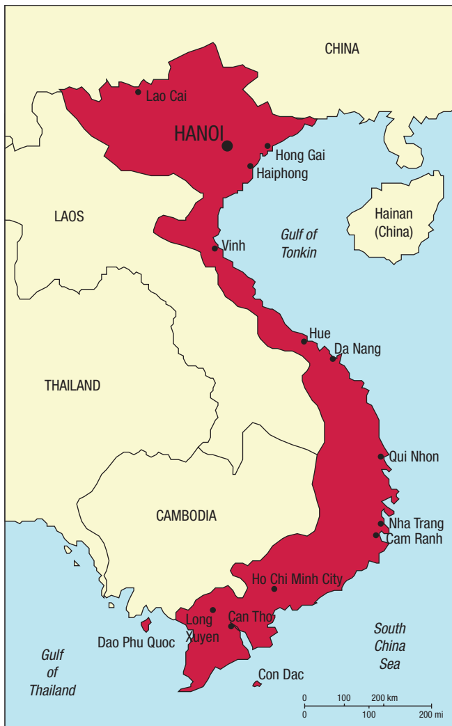
Figure 1. Location of Hanoi

The city is one of the oldest capitals in South East Asia, and in 2010 will celebrate its 1000 th year of existence. Its rich, and at times turbulent, history has seen a number of different ruling dynasties and much conflict (Boudarel and Ky, 2002). Hanoi was under Chinese rule from the 1 st century BC through to the 10 th century AD, followed by approximately eight centuries of Vietnamese rule, which ended in 1874 when the French captured the city. When the French were defeated in 1954, Hanoi returned to Vietnamese rule, but self-rule was again threatened during the American War, which was waged from 1954 until the Americans were finally defeated in 1975.