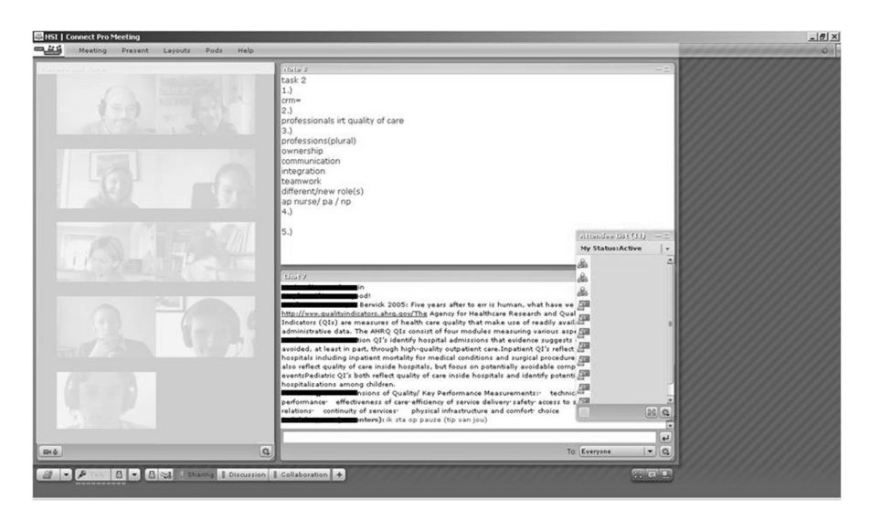
Fig. 1 Preliminary discussion of a synchronous online PBL tutorial group meeting

scribe and the others were group members. They exchanged ideas, thoughts and views concerning a problem. A tutor supervised the online tutorial groups (cf. [8]).