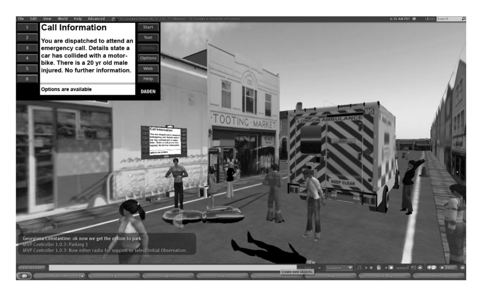
Fig. 2 Second Life Street Accident Scenario with the patient mannequin on the floor near his motorbike