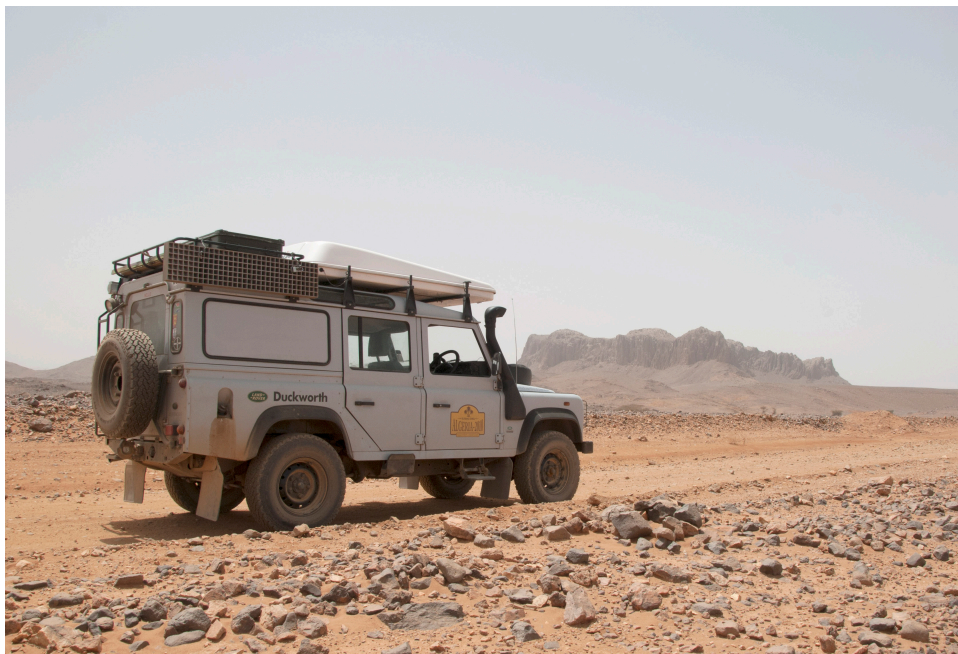
Figure 4: A Land Rover Defender on the overland trail in central Algeria, 2010. This type of experiential knowledge is essential to fully appreciate the phenomenological, social and cultural significance of this design historical artefact.

It should be clear now, then, that individuals and enthusiast groups dedicated to particular aspects of material culture frequently emerge and manifest themselves in a variety of ways; whether it be clubs, individuals collecting particular items they take an interest in, or re-enactors interacting with objects from the past. These interested groups or individuals can hold considerable knowledge and expertise about an artefact and its history—the most characteristic of which is probably what Oddy calls ‘[the] experiential knowledge of collecting and its methodologies acquired through ownership of the things’ (Oddy, 2013).