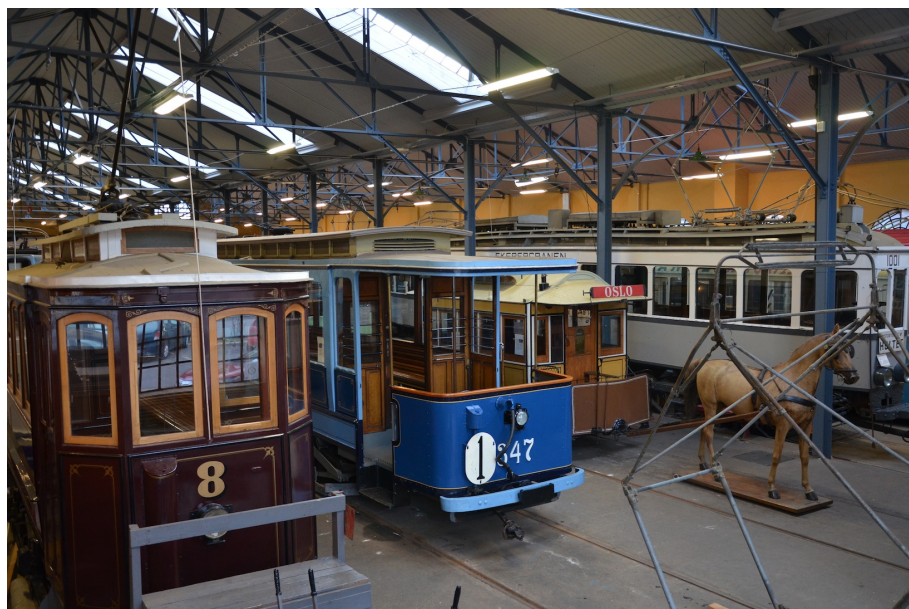
Figure 2: From the exhibition hall at the Oslo Tramway Museum, an institution run entirely by enthusiasts.

enthusiast associations set up and run museums that, at least to the casual visitor, may be hard to distinguish from conventional professional museums. (Figure 3)