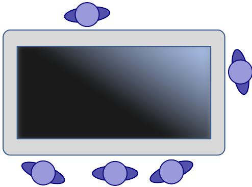
Figure 4: Co-located touch tables promote multiple viewing angles

Based on the extant literature we make the following hypotheses.