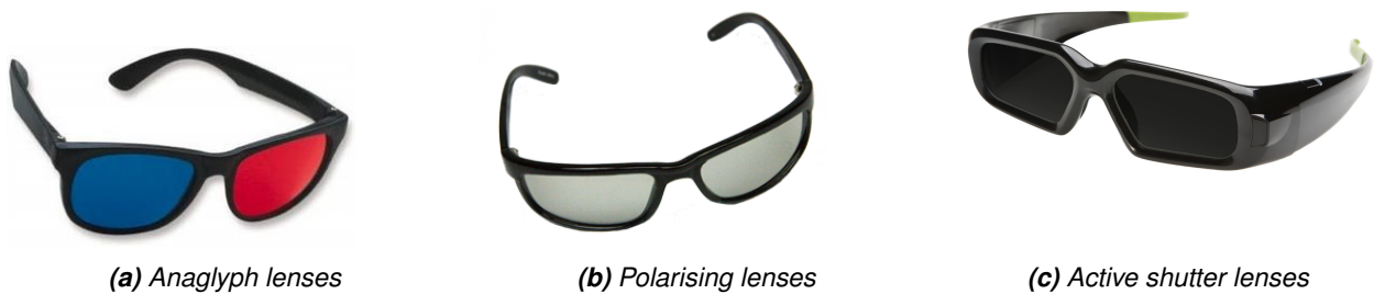
Figure 2: Passive and active filter lenses