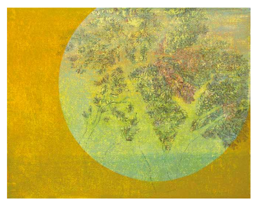
To the Moon oil on paper 50 x 65 cm