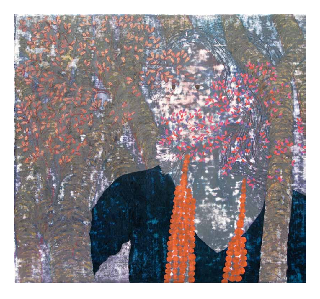
Wedded to Silence oil on linen 55 x 60 cm