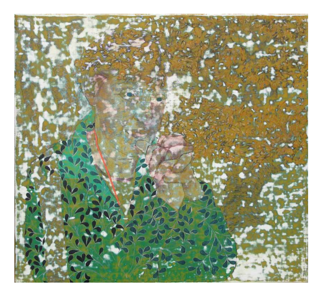
Salt-Stopped Hands oil on linen 55 x 60 cm