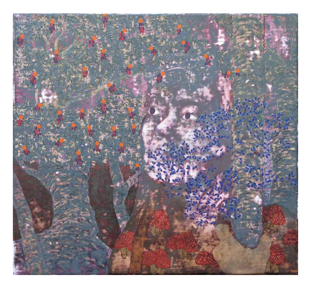
I Soothe Your Sore Eyes oil on linen 55 x 60 cm