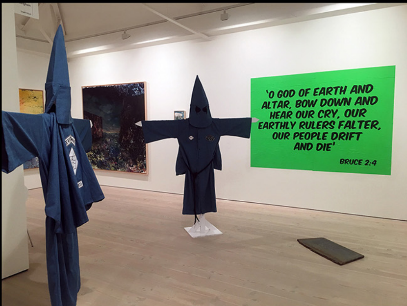
Start Art Fair, installation view of, 'Revelations: The Poison of Free Thought Pt. I', 'The Idiots are Winning' and 'Revelations'