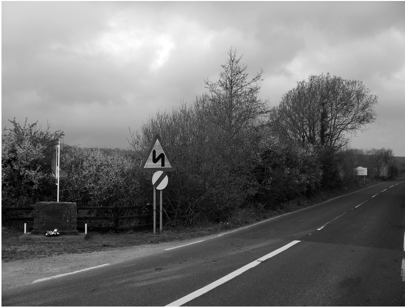
Figure 1.3 Border between Republic of Ireland and Northern Ireland

contested zones, such as the Ferghana Valley in central Asia where Uzbekistan, Kyrgyzstan and Tajikistan intertwine, state efforts at nation-building and associated territorial demarcation have very real impacts (Megoran 2017). Border areas may assume a very central importance for newly emerging states such as South Sudan where central government needs to be seen to assert control and, in doing so, to reinforce ideas of national identity (Frahm 2015).