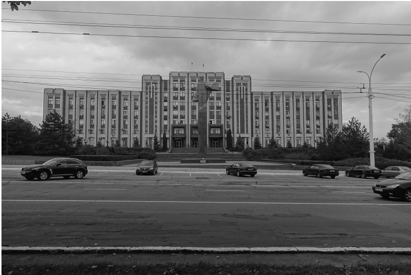
Figure 1.1 Parliament building in Tiraspol, capital of the breakaway Transnistria Republic