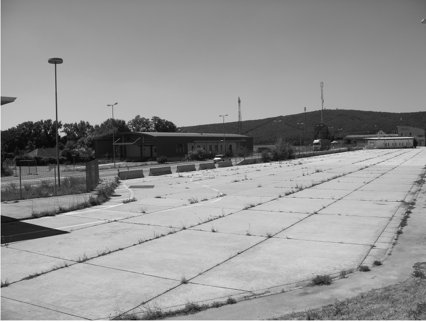
Figure 1.2 Unpatrolled border crossing between Slovakia and Austria near Bratislava

Borders are not just lines dividing territory; they are social and discursive constructs with important ramifications not just politically, but also in people's everyday lives. In many respects, the imposition of a physical border can result in the emergence of a partitionist mentality contributing to the essentializing of national identity and the accentuation of linguistic and cultural divisions. The evolution of a sense of difference between 'east' and 'west' Germans might be seen as a consequence of that country's political division between 1945 and 1991. Similarly, other national borders which served as Cold War boundaries had profound impacts on those living in close proximity to them (Meinhof 2002). Political decisions taken in remote political centres can have dramatic effects on people who find their lives disrupted by shifting borders, as the partitioning of space also partitions the lives of many. The demise of the Soviet Union had serious repercussions for more nomadic groups who found their territory ruptured by international boundaries. Any redrawing of borders will of necessity result in some finding themselves on what they feel to be the 'wrong side' or having their mobility circumscribed by its presence. In a myriad of ways, borders become elements within people's everyday lives and shape their day-to-day being (Leary 2016; Nash et al. 2016). For people in