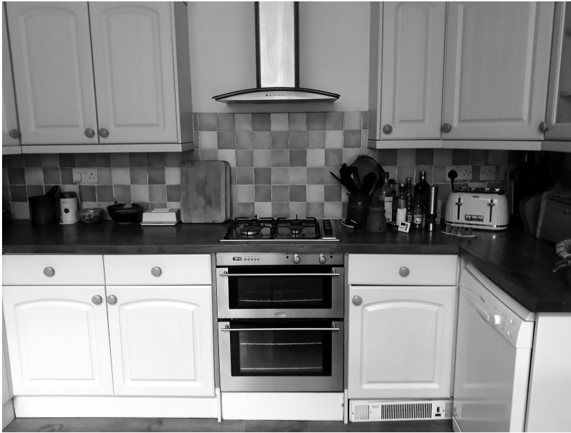
Figure 9.2 Home spaces: kitchen

essentializing sexuality and reinforcing a gay-straight dichotomy. Nevertheless, the fact that those who identify themselves as gay and lesbian do, in some instances, become associated with particular (usually urban) spaces, suggests that another form of territorial behaviour may be evident. A concentration of visibly gay restaurants, bars and clubs results in the creation of what Castells (1997, p. 213) calls 'a space of freedom'. Places such as the Castro District of San Francisco and the more spatially confined 'gay village' in Manchester serve as important examples, while the city of Brighton has acquired an image as the 'gay capital' of the UK (Browne and Lim 2010).