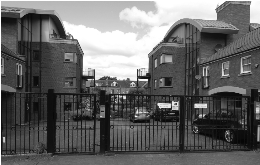
Figure 9.1 Gated residential development, Worcester, UK

be interpreted as a very obvious manifestation of attempts to control and limit access to portions of geographic space. The creation of residential fortresses where security guards patrol the perimeter of walled residential zones, in an effort to exclude those seen as undesirable, serves to maintain the 'undefiled' and 'exclusive' nature of the neighbourhood. The level of fortification of these developments may be quite varied, ranging from perimeter walls, gates and barriers, through the limiting of non-residential access by intercoms and associated screening devices, to more perceptual barriers or codes designed to deter (Figure 9.1). Individual streets, where homes are owned by a super-rich global elite, may be subject to private security and monitoring. In these ways, parts of previously public space become hived off, rendering them inaccessible to those not entitled to enter. Formal and overt security, combined with informal types of self-policing, where people are encouraged to report suspicious behaviour, reproduces ideas of who is allowed in particular places but also reaffirms the types of behaviour that are deemed acceptable in those places (see Yarwood, Chapter 8 in this volume). The increasing role of private security firms and the rise of forms of voluntary and community policing raise serious questions about legality and accountability.